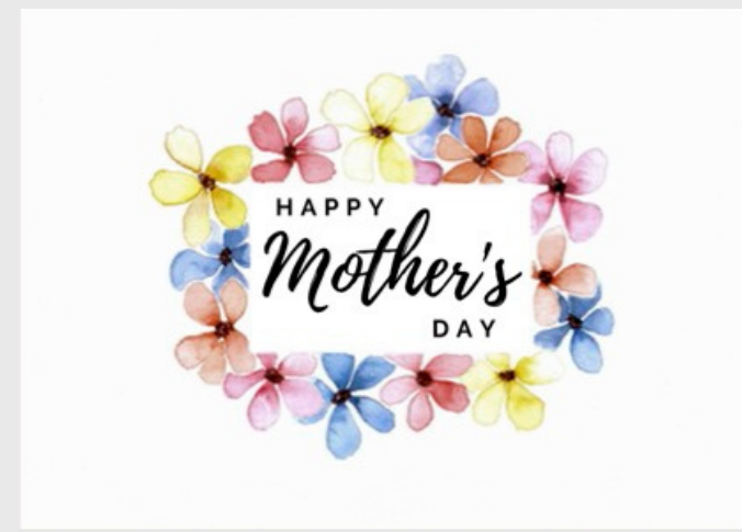
Mother's Day (mum 004) by HM "Have a very special day!"