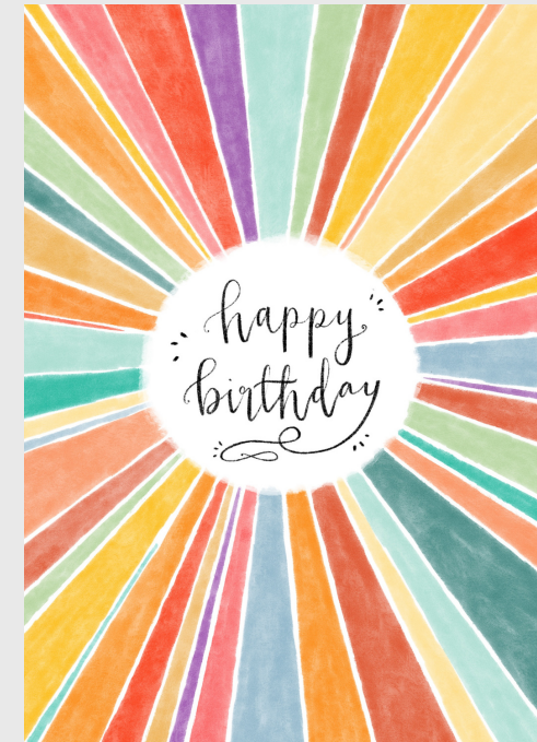
Birthday (birth 003) by EA "Happy Birthday"