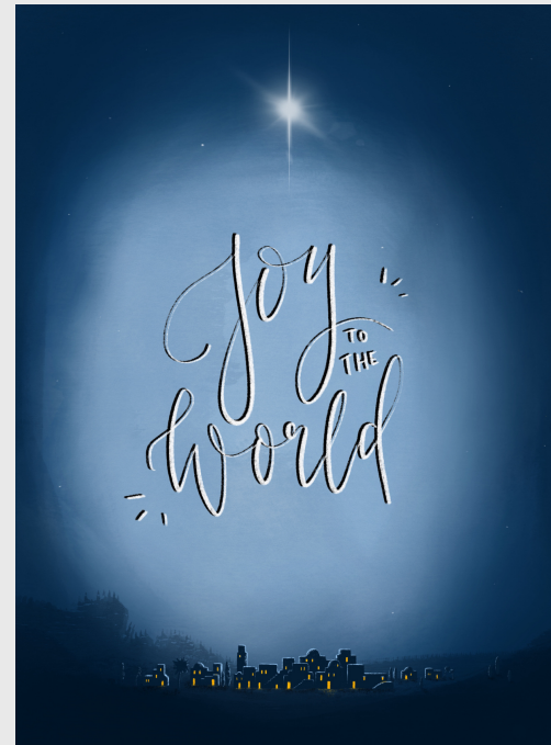
Christmas (joy 002) by EA "Merry Christmas"