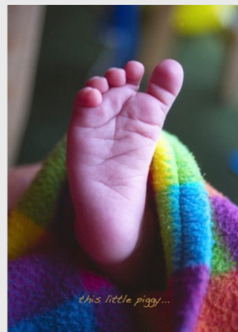
This little piggy... (baby 009) by HM "Congratulations"