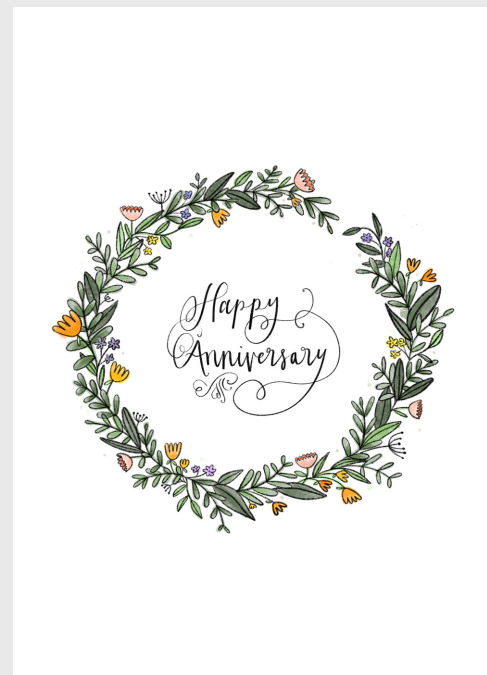
Anniversary (ann 005) by EA "Happy Anniversary"