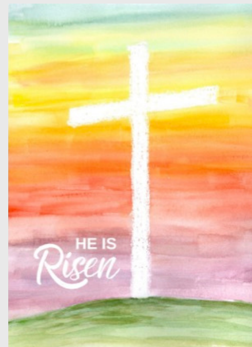
Easter (easter 007) by HM "Happy Easter"