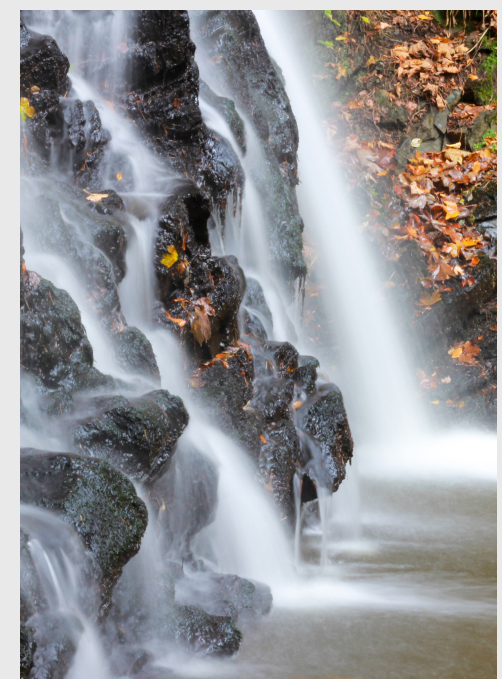
Waterfall (water 010) by HM blank