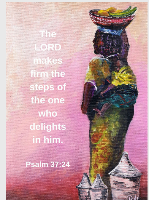
Market day (market 006) by PA blank