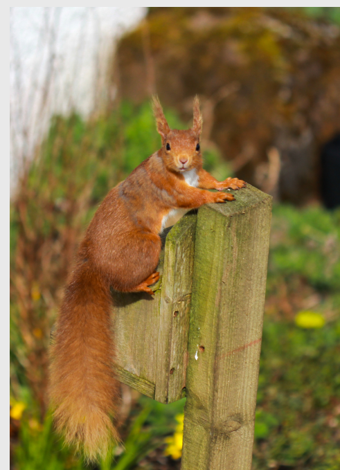
Squirrel (squirrel 011) by HM blank