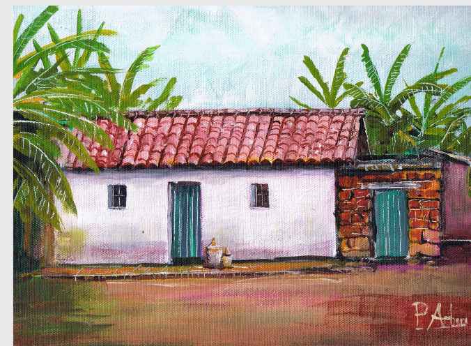
African Home (home 008) by PA blank